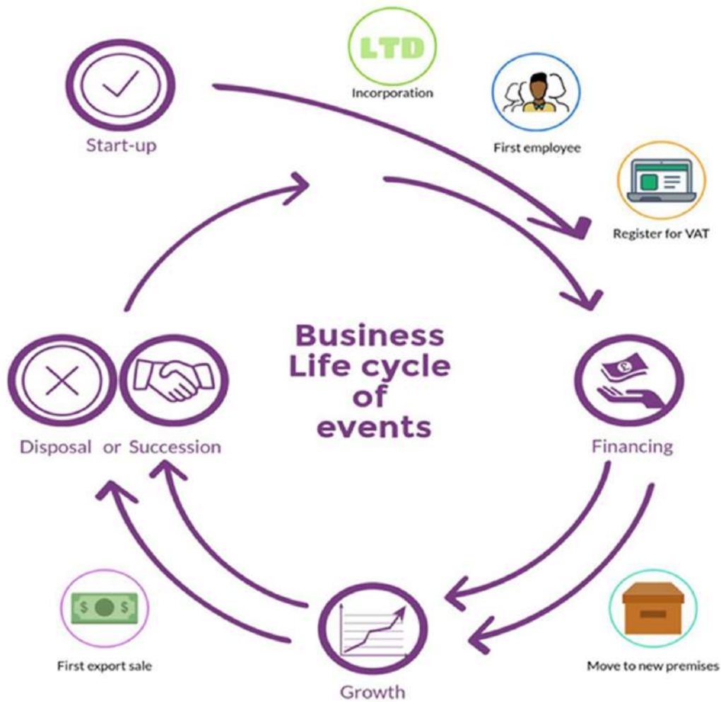
Chart 1.A: Business lifecycle of events